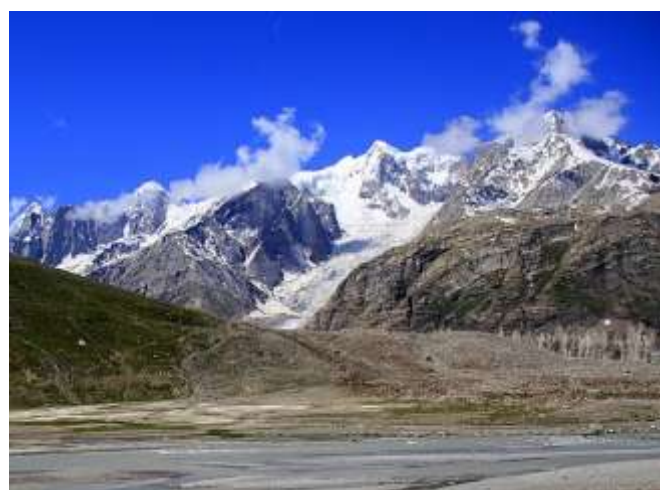
Fig. 4: Exposure of clay and sand materials to the west of the barrier of lateral morainic ridge showing the evidence deposits of former moraine-dammed lake