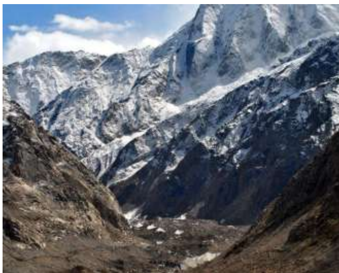
Fig. 3 Debris covered snout part of the Bara Shigri glacier

Existence of the above morainic ridges with their typical locations, extensions, varying thickness and elevations can be interpreted in the following manner. The first ridge (Ridge 2) of moraine can be attributed to the maximum limit of the 'Little Ice Age' glacier advance. This is in conformity with the view of Egerton & Tyacke, 1893 ( cf. Mayewski and Jeschke, 1979), who maintained that the Chandra River was dammed to a lake by this glacier advance during the Little Ice Age. The observed scattered deposits of verved clay materials around the Chandra river bed adjacent to the morainic ridge (Ridge 2) bear clear evidences lake deposits. However, the low height of the morainic ridge across the river bed suggests that at the maximum stretch, although the glacier temporarily choked the flow of the river, it was just sufficient to give rise to a shallow lake of temporary form. One possible way by which the lake ceased to diminish was by the water flowing over the ice-barrage. This has been common for the lakes held up by the sub-polar and temperate glaciers (Maag, 1969 cf Grove, 2003; Sissons, 1979). Several instances of Glacial Lake Outburst Flood have also been reported from many glaciated parts of the higher Himalayan regions ( viz. , ICIMOD, UNEP (2002).